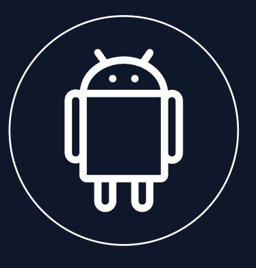
Android 12 Operating System